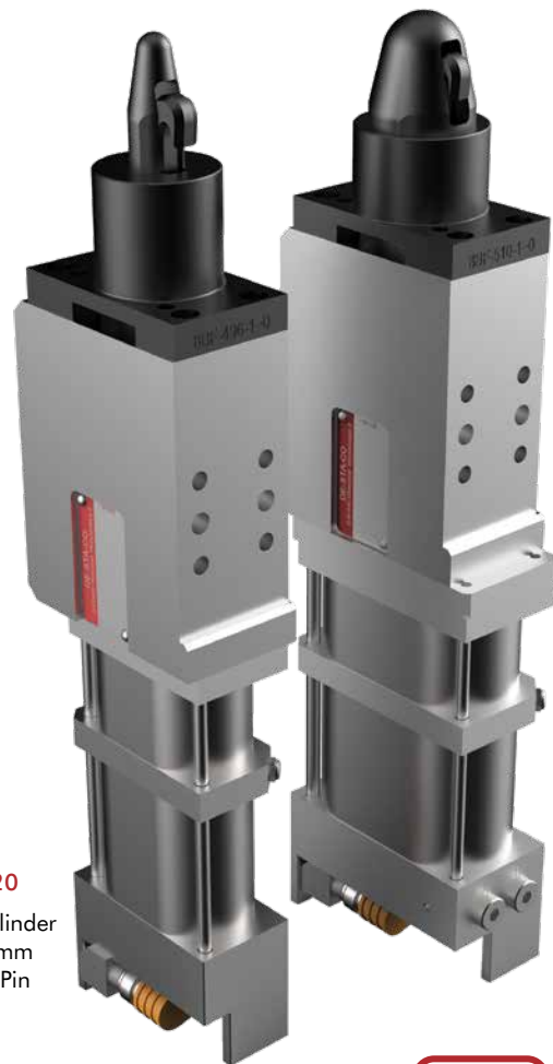
82P50-720 50mm Cylinder with 19.9mm Diamond Pin

Destaco's 82P-720 Series tolerance compensating pin clamps are designed to hold different sheet metal thicknesses without the need to use shims. The 82P-720 features tandem cylinder that provides consistent clamping force throughout the closing stroke. The sensing system can be mounted at different positions and has a plug can be pivoted. Different pin diameter and shapes are available for greater flexibility in accuracy.