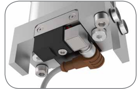
Sensing and 1/8 G ports located at the bottom

Centering Pins are designed with a channel for easy cleaning.