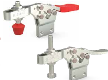
-UBSS Stainless Steel Model