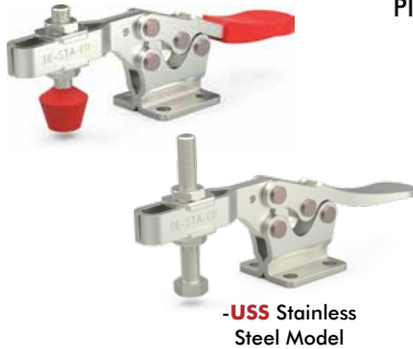
-USS Stainless Steel Model