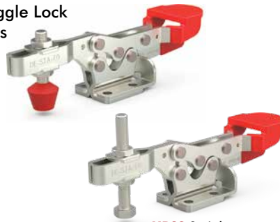
-URSS Stainless Steel Model