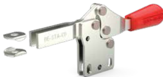
Straight Base Model 217-UB-L

See page MC-ACC-7 for Complete offering of Open bar accessories