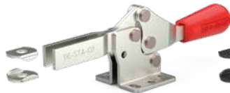
217-U-L-BLK ⓘ Flanged Base Open Bar