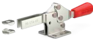
Flanged Base Model 217-U-L